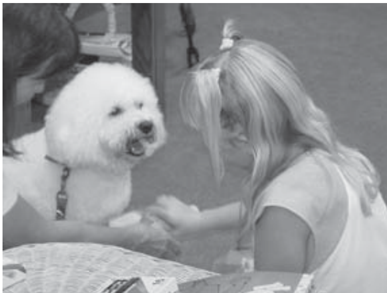
Gigi, a therapy dog from the Midland Children's Advocacy Center in Midland, Texas with a young girl.

Recognizing these issues, many states are now moving toward mandating animal control officers to report evidence of child abuse or domestic violence when investigating animal abuse cases. 8 Animal control officers are often in a position to observe a neglectful environment shared by humans and companion animals. These same states are cross-training child protection workers, domestic violence professionals and animal control officers to work with each other to report both child and animal abuse discovered in the home. Many states are now bringing law enforcement officers, domestic violence and child protection professionals, and animal control officers together in a coordinated response to help protect children, domestic partners, and companion animals from abuse in the home. Doing so will help to marshal and coordinate treat-