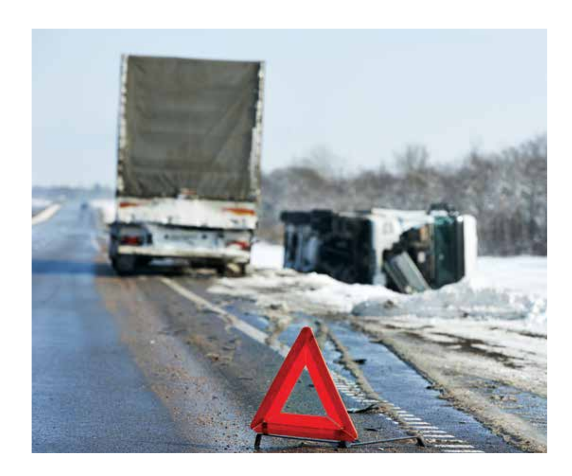
An injured worker involved in a work-related accident while operating or occupying an employer's vehicle will still look first to workers' compensation for medical coverage.