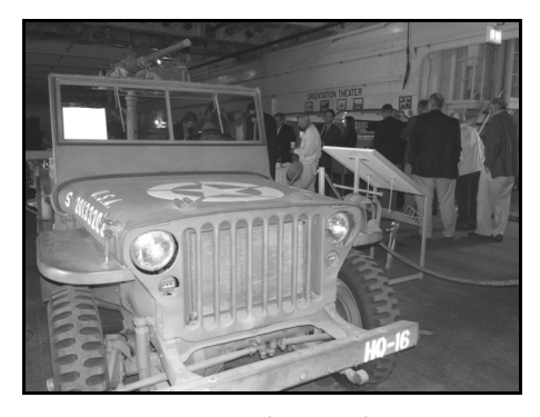
WWII-era Jeep, on loan to the museum