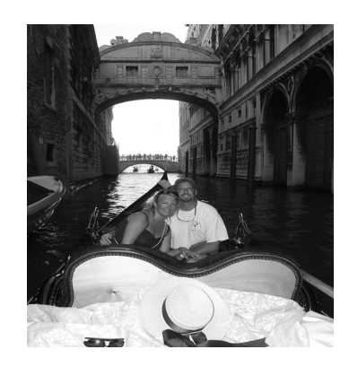
Honeymooners at Bridge of Sighs in Venice, the Coliseum

tury to connect the palazzo and the Courts of Justice to the prisons – thus the name. Prisoners condemned to death could be heard sighing as they passed over this bridge both on their way into prison and eventually on their way to execution in Piazzetta San Marco.