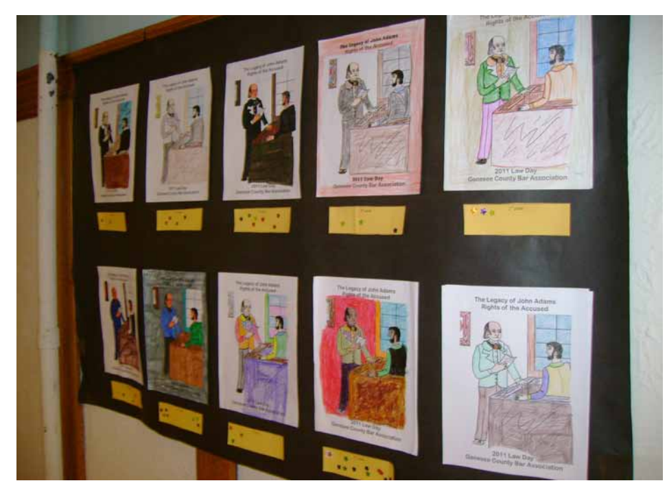
Genesee County Bar Association Law Day poster contest entries