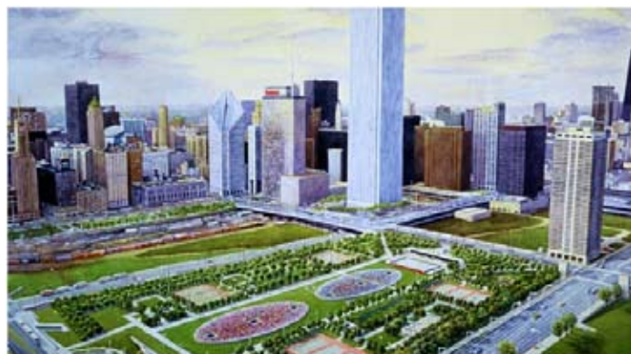
Aerial view of the garden at issue in Kelley v. Chicago Park District