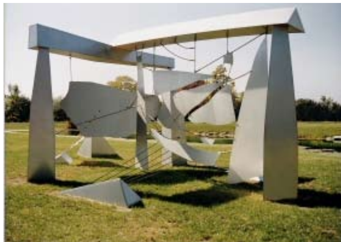
Vacant or overgrown lot with sculpture

(2) Ownership of the rights conferred by subsection (a) with respect to a work of visual art is distinct from ownership of any copy of that work, or of a copyright or any exclusive right under a copyright in that work. Transfer of ownership of any copy of a work of visual art, or of a copyright or any exclusive right under a copyright, shall not constitute a waiver of the rights conferred by subsection (a). Except as may otherwise be agreed by the author in a written instrument signed by the author, a waiver of the rights conferred by subsection (a) with respect to a work of visual art shall not constitute a transfer of ownership of any copy of that work, or of ownership of a copyright or of any exclusive right under a copyright in that work.