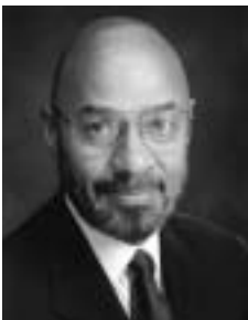
Dennis W. Archer