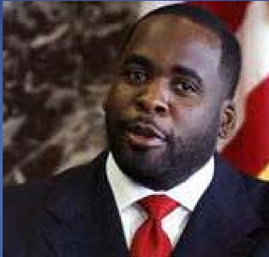
Kawme Kilpatrick, former Mayor, City of Detroit