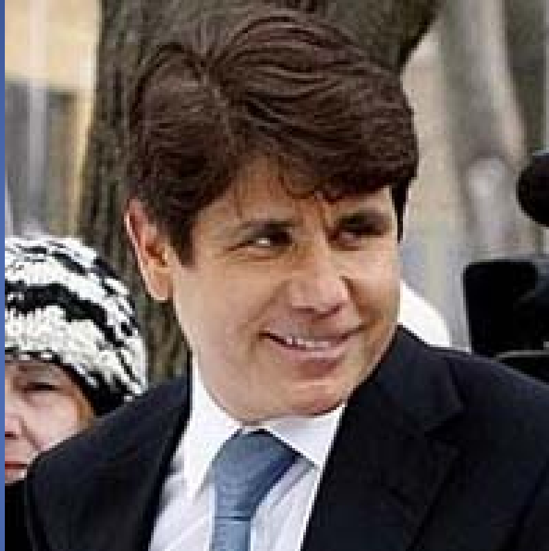
Rod Blagojevich, Former Governor of Illinois