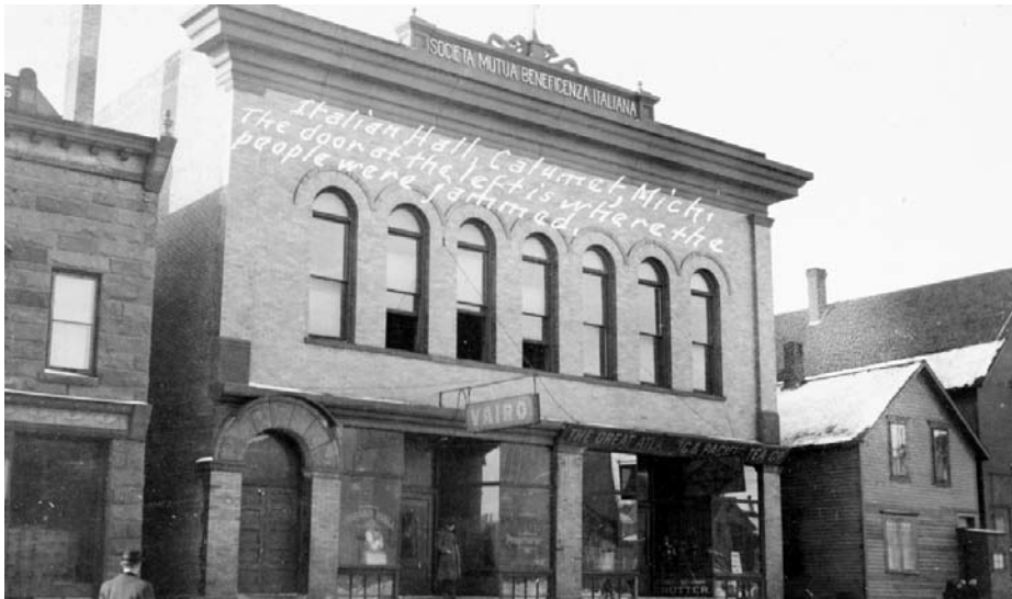
The Italian Hall in Calumet, Michigan, as it appeared in 1913. The arched doorway on the left led to the staircase down which miners and their children stampeded to escape a fire that didn't exist. Seventy-three people, mostly children, perished.