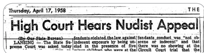
Headline from April 17, 1958, Battle Creek Enquirer by paper’s State Bureau. Used by permission.