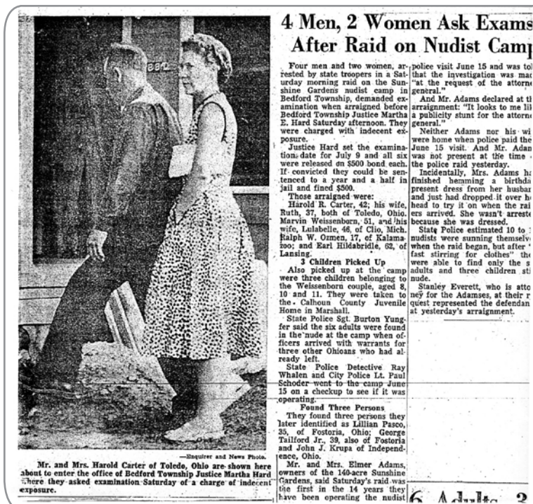
Article from July 1, 1956, Battle Creek Enquirer .

In the meantime, the Sunshine Gardens nudist colony had been hosting families on its 140-acre campus outside of Battle