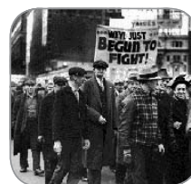
The Flint auto plant strikes were among the most important strikes in Michigan and laid the groundwork for later strikes like the one at Book Tower Garage. Here, union workers and sympathizers march toward a rally supporting the Flint auto plant strike in Detroit’s Cadillac Square in early 1937.

Federal and state governments gradually adopted more pro-union policies in the first third of the twentieth century. The effort had the greatest effect in the railroad industry, because of the economic power of skilled railroad brotherhoods and the devastating effects of nationwide transportation disruptions. Congress attempted