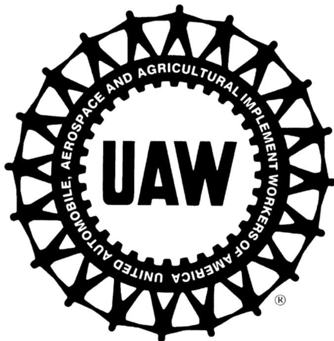
The UAW, which was founded in May 1935 in Detroit, began a strike on the Book Tower Garage in 1940.

By and large, Americans accepted the free labor or “laissez-faire” system. The overall benefits of a free market outweighed the harshness, selfishness, and even cruelty, that the ethos of “every man for himself, and the devil take the hindmost,” might promote.