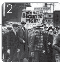
2 Book Tower Garage v United Auto Workers: Michigan's New Deal

Welcome to the third issue exploring the following cases: