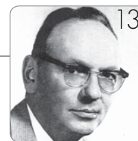
13 Scholle v Hare: Judicial Power and Democracy (III)