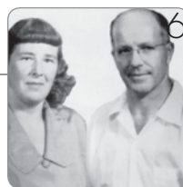
6 People v Hildabridge: Voelker and the Art of Crafting an Opinion