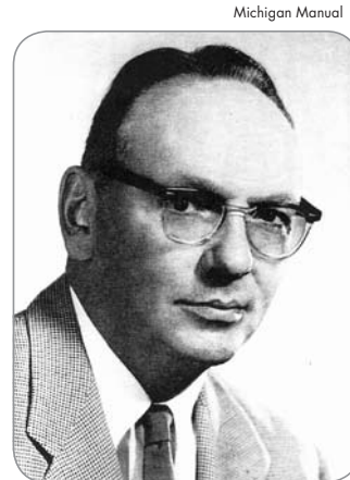
Secretary of State James M. Hare

The political impact of malapportionment in Michigan in the 1950s was to increase the power of rural, and at this point, predominantly Republican and conservative voters, at the expense of urban, usually Democratic and liberal, voters. Often state legislatures flouted provisions in their own constitutions for periodic reapportionment. In 1960, 36 state constitutions required such redistricting, but 24 legislative houses had not been reapportioned for over 30 years. 1 Michigan reapportioned its legislature in 1952, but still permitted variance ratios of 2:1 in the House of Representatives and 10:1 in the Senate. A majority of the state’s voters approved a referendum (Proposition 3) that year that explicitly allowed Senate districts to be based on geographical area rather