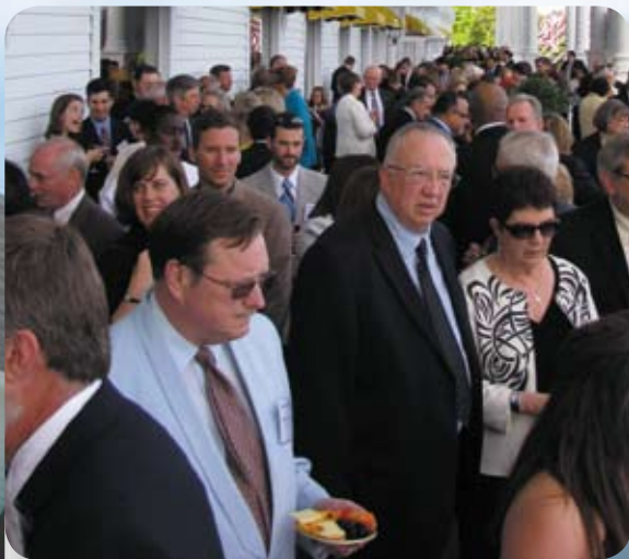
About 400 people, including attorneys and their guests, were at the Grand Hotel on Mackinac Island for the annual Bar Leadership Forum and Upper Michigan Legal Institute. Sunny weather and warm temperatures made for an especially enjoyable social hour on the grand porch Friday.