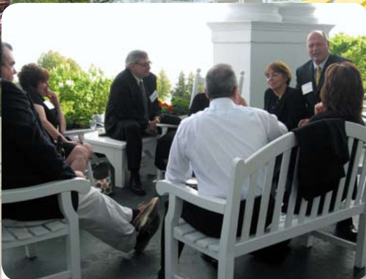
Group discussion on the porch.

Attendees at the UMLI sessions had an opportunity to get updates in various areas of the law, including real property, estate planning, family, and criminal law developments. They also picked up practice management resource tips from the State Bar and the Institute of Continuing Legal Education.