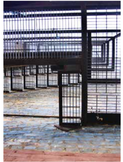
Ariel Norder, "Rectangle"