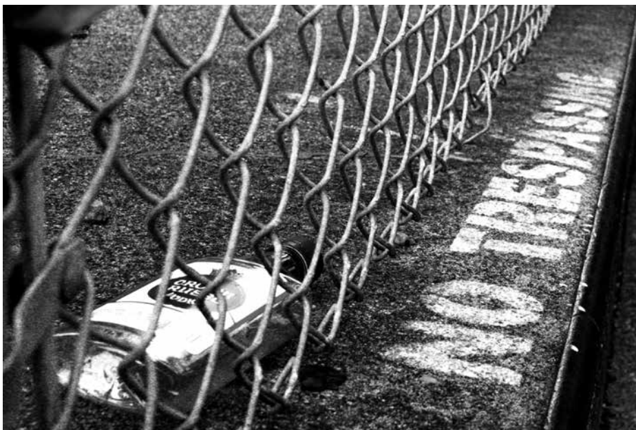
Brittany Kibbey, "No Trespassing"

Part of the WMCAT culture is that if you treat people with dignity, invite them to learn in a space that promotes success, and give them the right tools, they will aspire to great things.