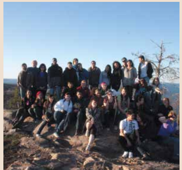
WMCAT students enjoyed a trip to visit Northern Michigan University.