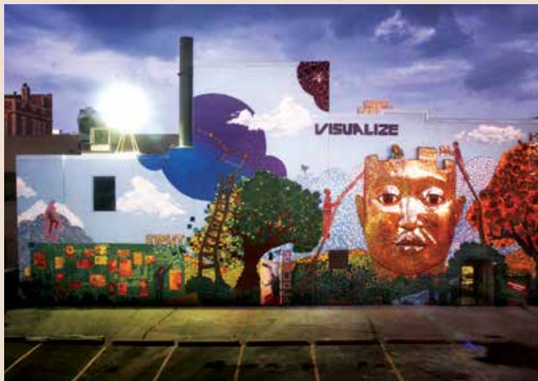
WMCAT students helped produce this mural for ArtPrize 2011, earning second place overall.