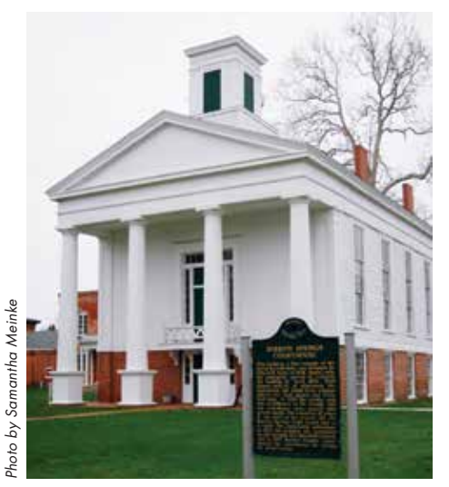
The 1839 Berrien County Courthouse in Berrien Springs will be the 38th Michigan Legal Milestone.