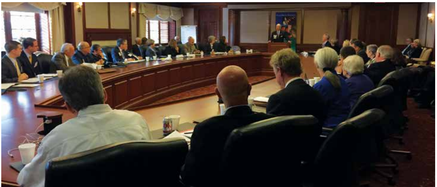
Participants in the “Future of Legal Services: Changes and Challenges in the Delivery of Legal Services” forum