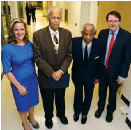
Activist Julian Bond