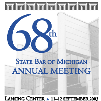
LANSING CENTER ▲ 11-12 SEPTEMBER 2003