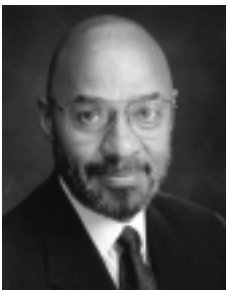
Dennis W. Archer