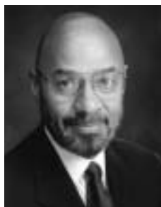
Dennis W. Archer