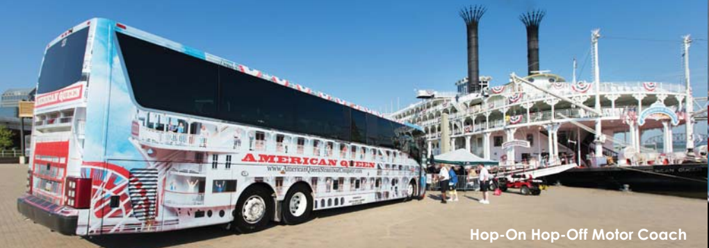
Hop-On Hop-Off Motor Coach