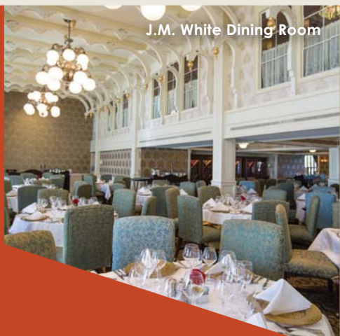
J.M. White Dining Room

Creating plates inspired by culinary classics of America’s South and utilizing the best of the season’s offerings from stops along the way, an award-winning culinary team lends its expertise to the unique dining experience on the American Queen . Indulge in the elegance of the J.M. White Dining Room, or satisfy your appetite any hour of the day at the Front Porch Café as you sample delectable creations, from pork loin stuffed with andouille sausage to corn fritters and bourbon pecan pie.